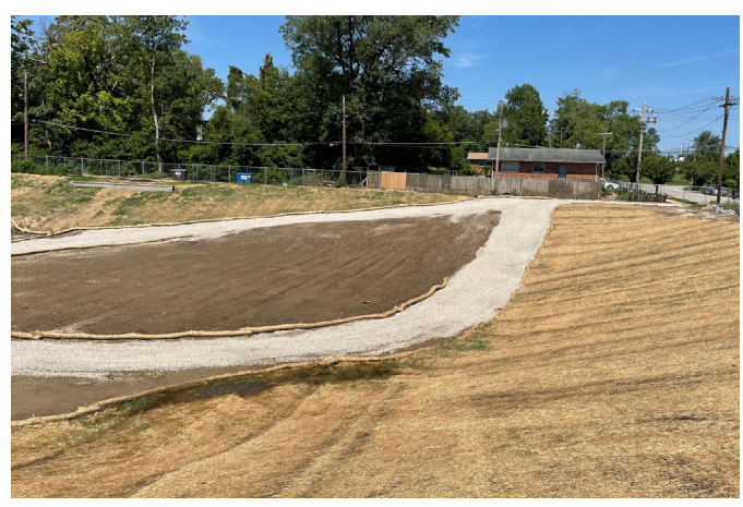
Flexamat infilled with aggregate for the site access roads