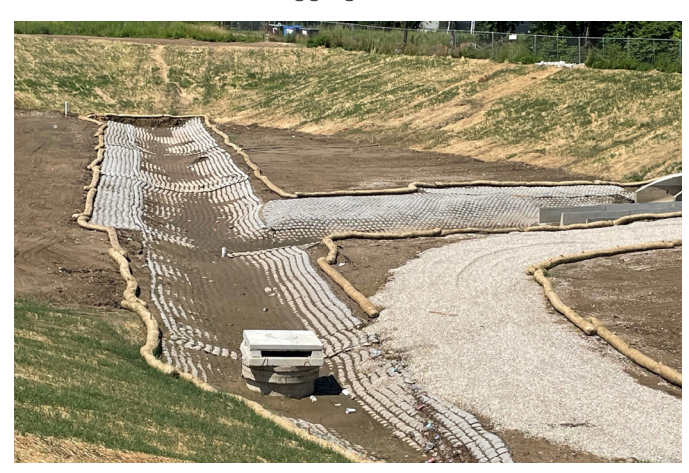
Flexamat installed in the water flow lines to prevent erosion. The site received a lot of rain after installation, so straw wattles are used to keep the mud off the Flexamat.