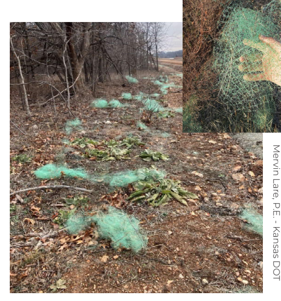
Photodegraded netting clumping up & blowing off the project like a tumble weed. This is now trash that needs cleanded up.

Hydraulically applied erosion control solutions being applied with a hydroseeder.