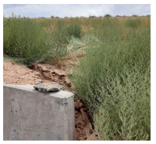
Plastic netting that has grown up with the tumble weeds, causing the washout behind the box wingwall.