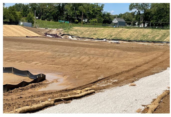
The sides of the basin are covered with erosion control blankets to protect the grass seed as the vegetation is established. The bottom of the basin will be covered in ECBs and vegetated as well.