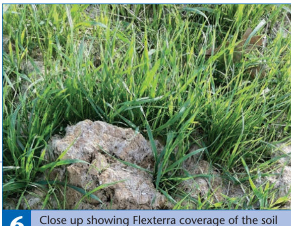
Close up showing Flexterra coverage of the soil