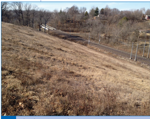
The slope 1 year after.