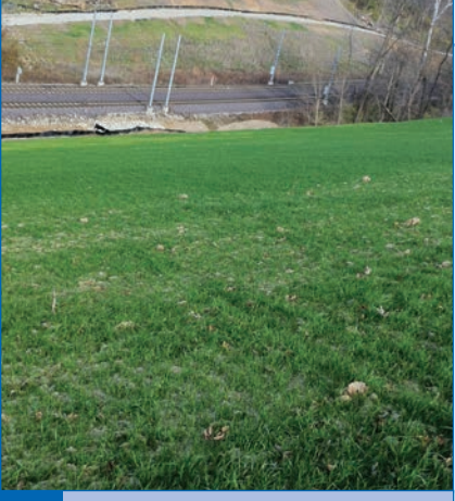
Another picture showing finished grading and vegetation establishment.