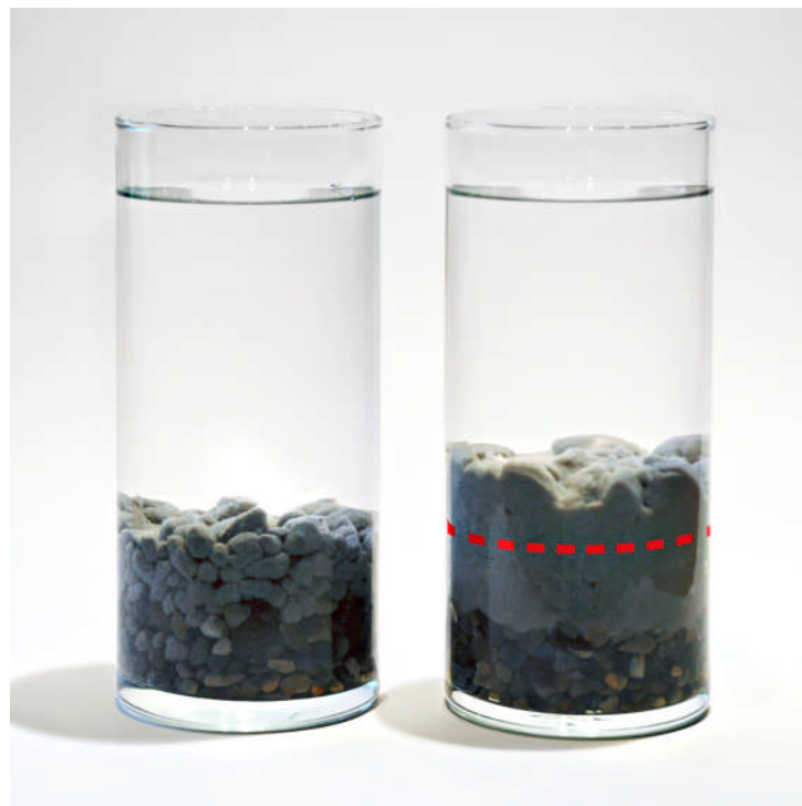
Figure 1. AquaBlok ™ applied at 7-lbs/ft 2 (~1” dry material thickness) atop ~1” layer of ordinary gravel. Time lapse: LEFT: immediately after inundation and RIGHT: 24 hours after inundation. Note original boundary between product and water (dashed red line) demonstrating swell/expansion of product over time.