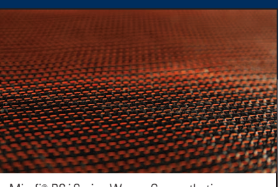
Mirafi® RSi-Series Woven Geosynthetic

Place the geosynthetic directly on prepared surface. It is advisable to leave vegetative cover such as grass and weeds in place to provide a support matting for construction activities. The geosynthetic should be deployed flat and tight with no wrinkles or folds. The rolls should be oriented as shown on plans to ensure the principal strength direction of the material is placed in the correct orientation. Adjacent rolls should be overlapped or seamed as a function of subgrade strength (CBR). Prior to fill placement, Mirafi® RSi-Series geosynthetics should be held in place using suitable means such as pins, soil, staples or sandbags to limit movement during fill placement.